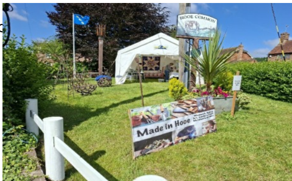
Ready for the off

HVCG is sincerely grateful to all who opened their garden and to the many other volunteers who helped with the event. Marquees needed to be erected, signs made and placed, tables and chairs transported, cakes and other refreshments baked, teas served, washing up and dismantling everything to be carried out. To show our appreciation we were pleased to invite all to a celebration thank you BBQ on the Sunday evening.