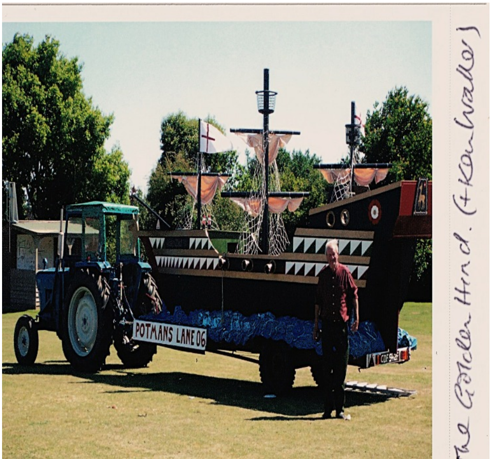
Potmans Lane Galleon Float